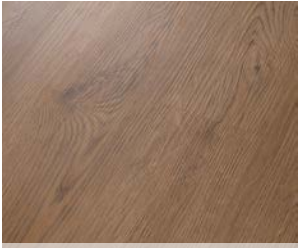
2083 Centaurus Oak